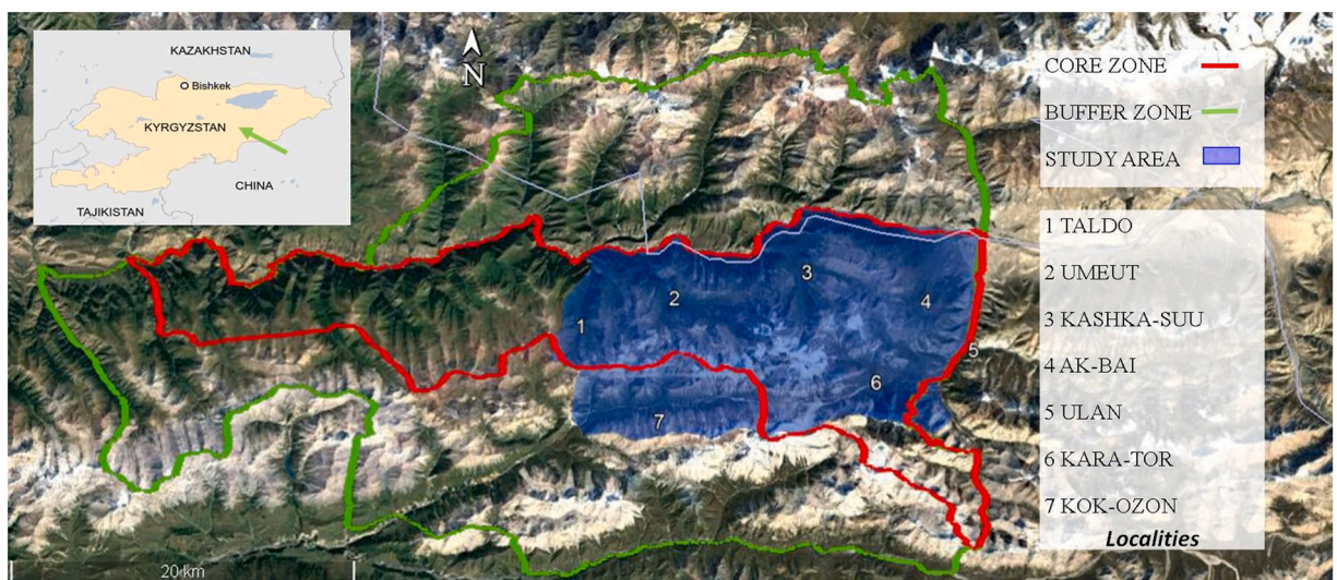
Fig. 1. Map of the study area in and around Naryn State Nature Reserve; Numbers on the map are referring to localities insert in the right bottom corner.

They registered fauna on the spot, all year long, except if unintentional triggers saturated the SD card and exhausted batteries or if the camera was damaged by fauna. The camera traps were checked at least once every summer, sometimes more often.